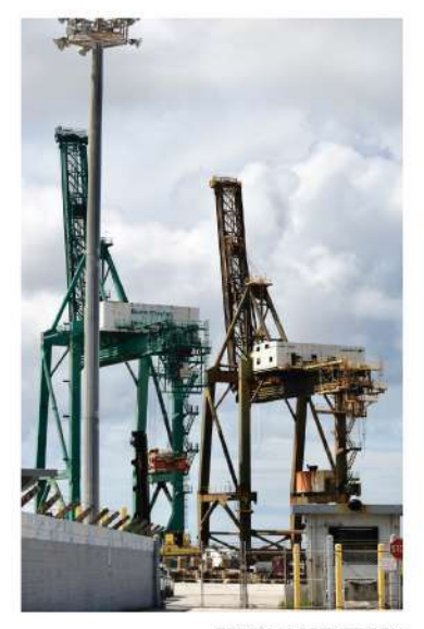
The Jose D. Leon Guerrero Commercial Port of Guam front gate on Oct. 16, 2023.

The port was established on Oct. 31, 1975 as a public corporation and autonomous instrumentality, naming it the Port Authority of Guam. On its 48th year, it has a total of 382 employees.